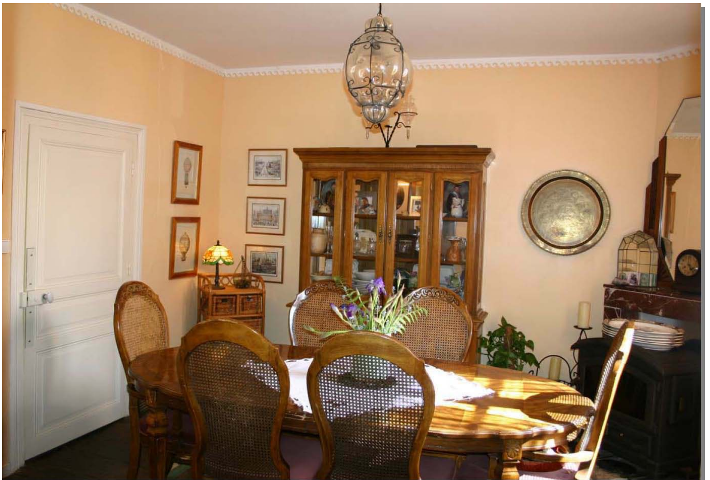
↑ Dining Room