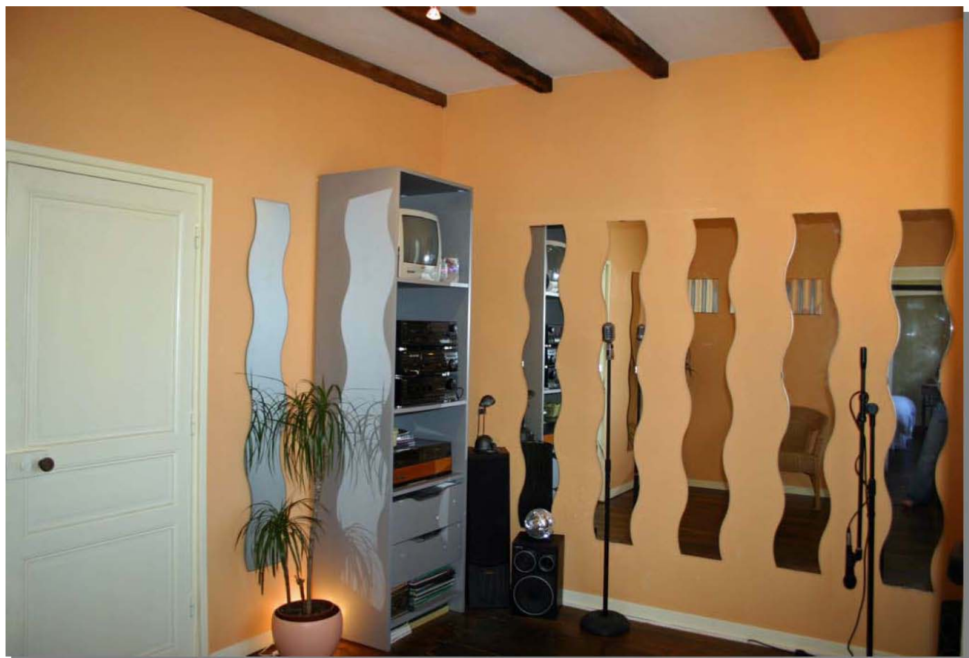
↑ Bedroom 4 (currently in use as a music room).