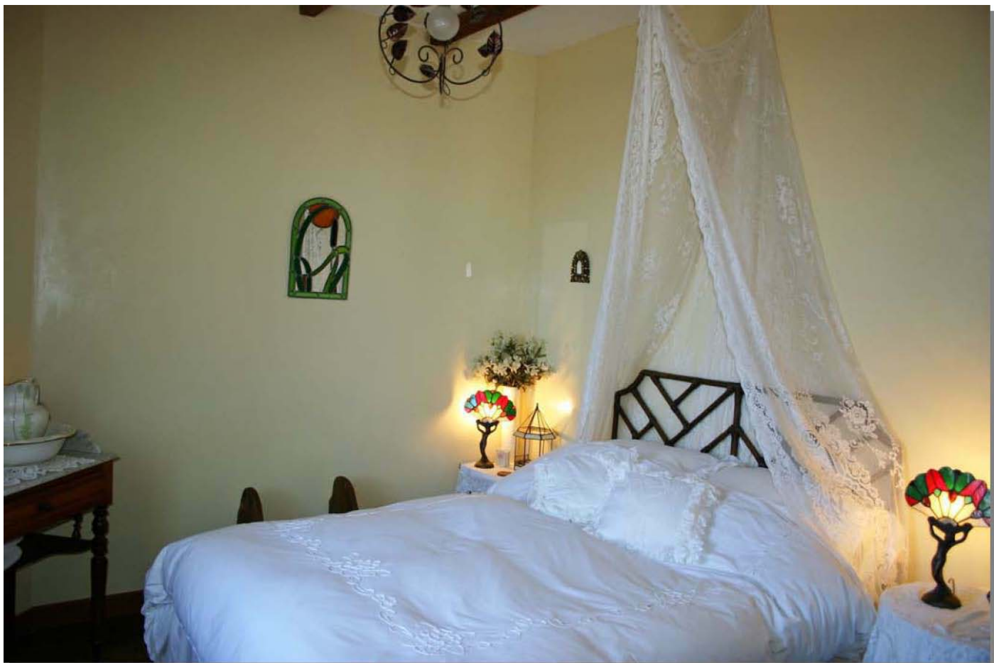
↑ Bedroom 3