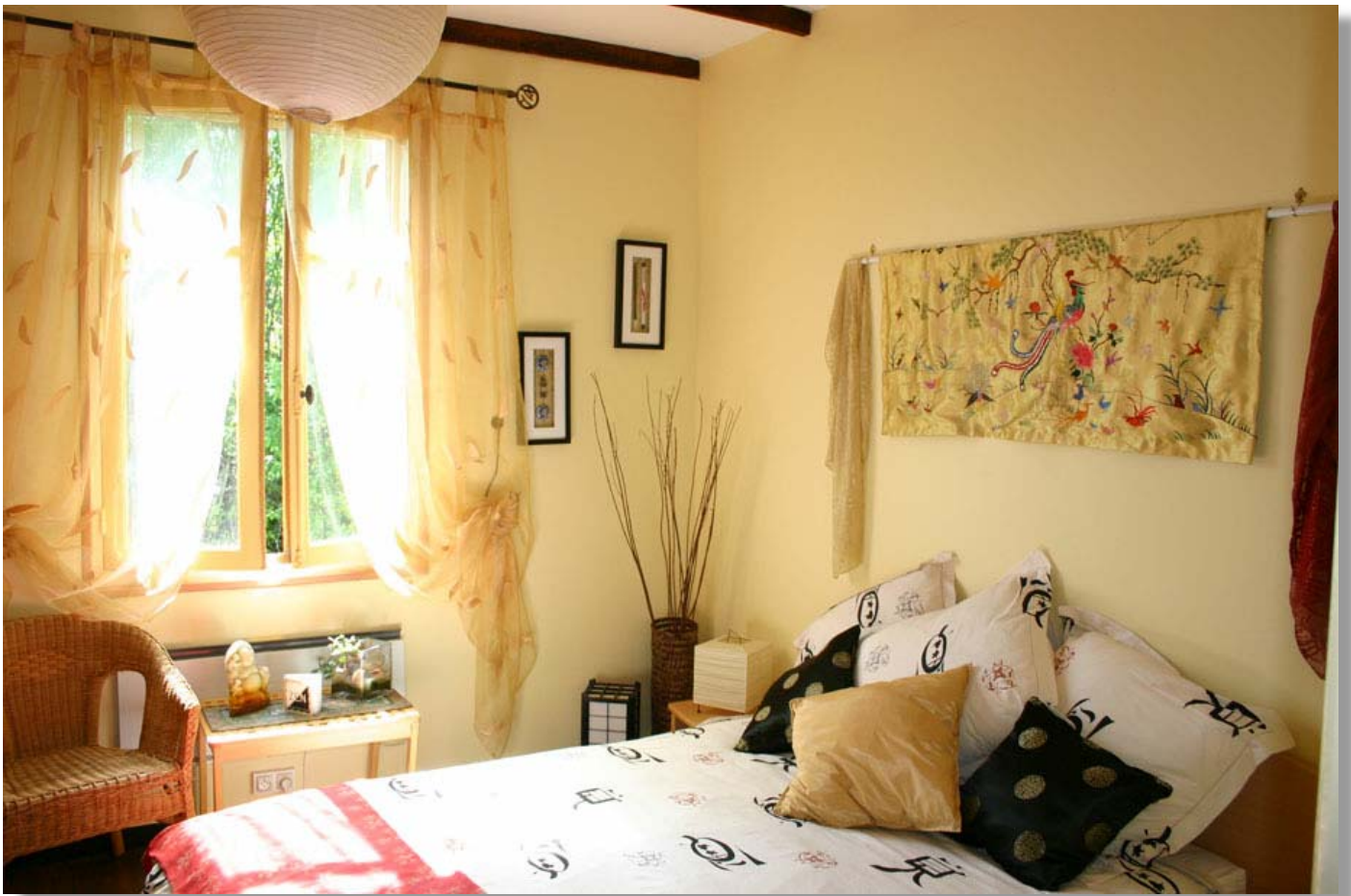
↑ Bedroom 1