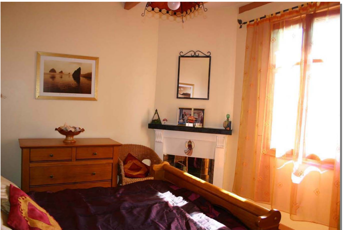
↑ Bedroom 2